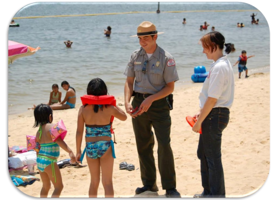
Work side-by-side with a dedicated Park Ranger.

The Corps of Engineers is the largest provider of outdoor recreation in the entire nation. Our highest priority is public safety. We are looking for motivated men and women that want to make a difference by helping us with our public safety mission.